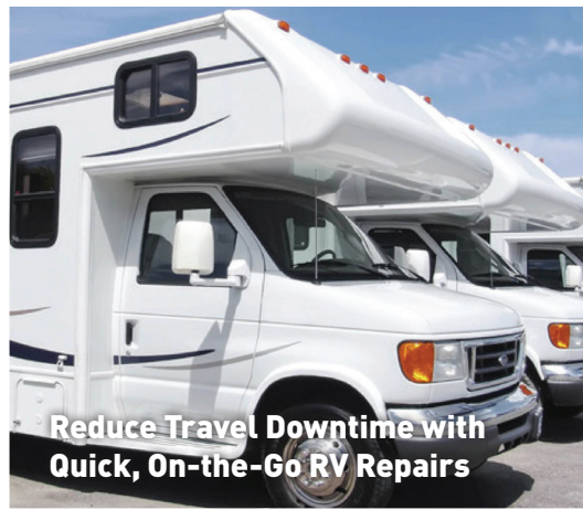
Reduce Travel Downtime with Quick, On-the-Go RV Repairs