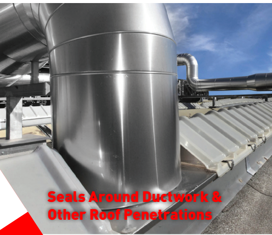
Seals Around Ductwork & Other Roof Penetrations