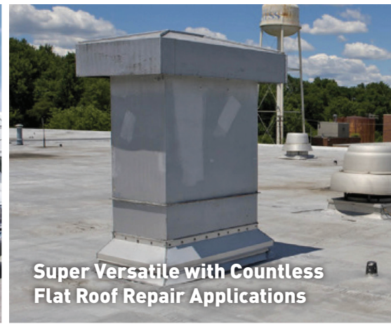
Super Versatile with Countless Flat Roof Repair Applications